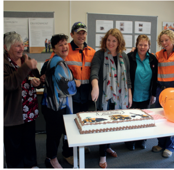
Five year anniversary celebrations at New Hope's Oakey Community Information Centre