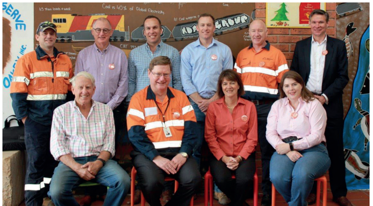
Members of New Hope's Executive and Board during the Board's visit to Oakey in August