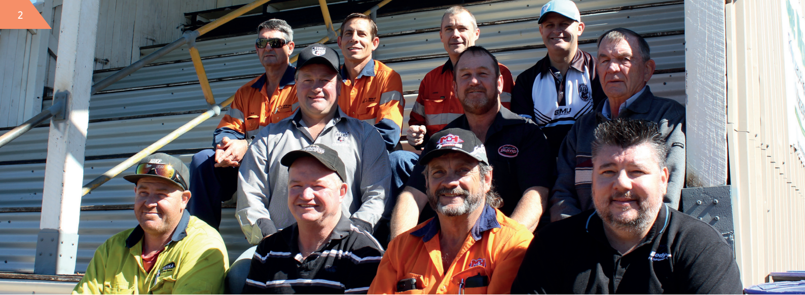
New Acland Mine and Oakey Rugby League Club reps getting ready for Legends of League