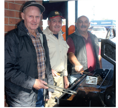
Oakey Men's Shed lending a hand at the five year anniversary of New Hope's Oakey Community Information Centre