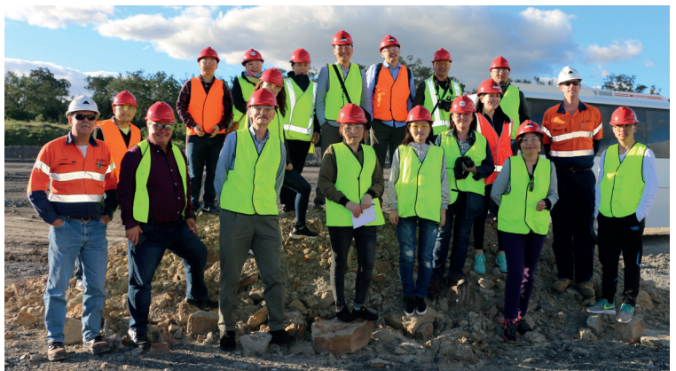
Mongolian journalists and representatives from The University of Queensland touring New Acland Mine